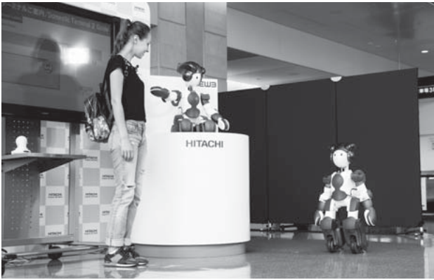
Photo of EMIEW 3 PoC testing at Haneda Airport