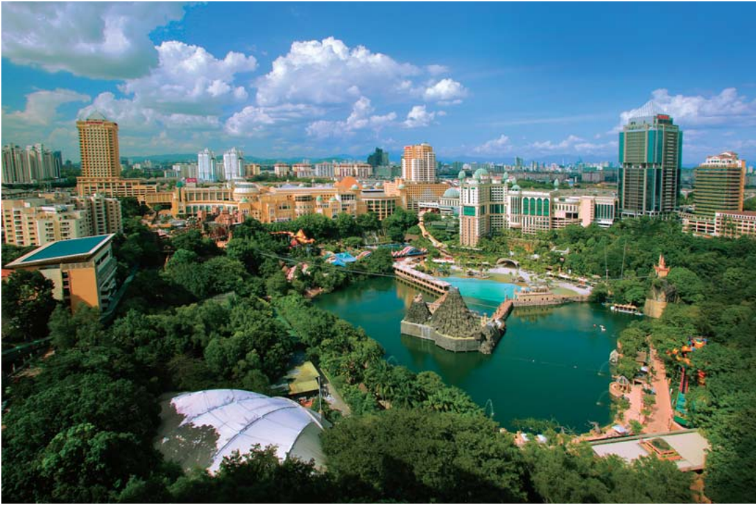
2 Sunway City, Malaysia's first fully integrated green township as certified by Green Building Index, Malaysia's industry recognized green rating tool for buildings

involved gathering and analyzing a wide range of data, and then applied the study findings to help reduce energy consumption. As a next step, with regard to improving air-conditioning system efficiency, Hitachi concluded a profit sharing, energy-saving guarantee service agreement for educational facilities, and is now