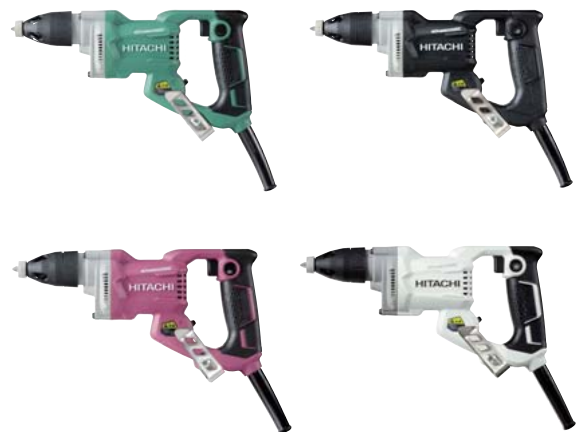
3 Color options for W4SE/W5SE board driver

(2) Achieves comfortable operation with low recoil and