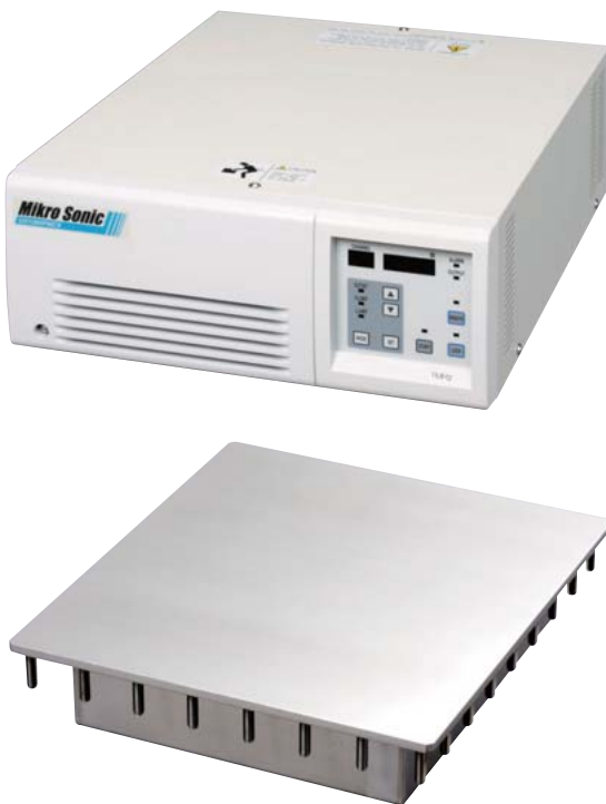
2 UO1200PMCX (1 MHz model for semiconductor) ultrasonic generator (top) and ultrasonic transducer (bottom)

The cleaning requirements differ greatly depending on the process, and the further downstream the process goes, the greater the damage due to cleaning on chip yield and reliability. Given this, ultrasonic cleaning of semiconductors employs different frequencies depending on the process. As damage due to cleaning has little impact on product quality during the initial processes, low frequencies in the range of several dozen kilohertz are emitted for powerful cleaning, while the megahertz band—less likely to cause product damage—is used to perform fine cleaning during the final stages.