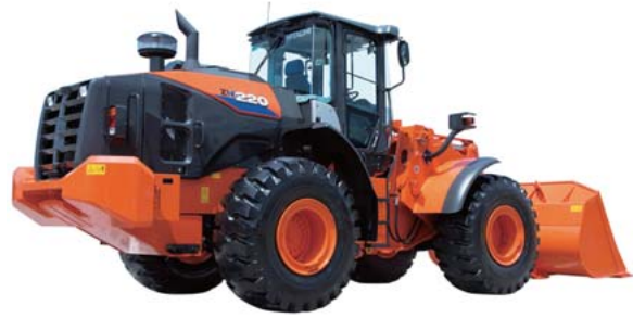
3 ZW220-6 wheel loader

(1) A ride control system and a lift arm smooth stop mechanism that helps relieve operator fatigue provided as standard.