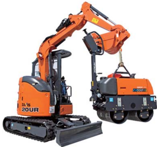
2 Canopy model (top) and ML crane model (bottom) of the ZX20UR-5A compact excavators