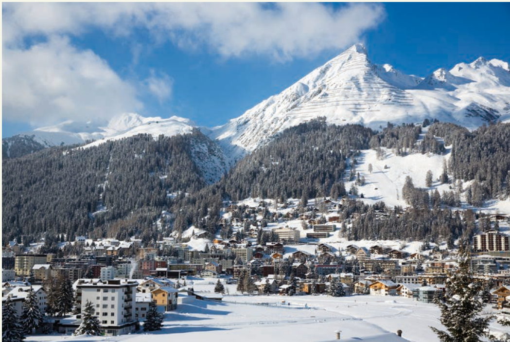
The city of Davos

Senior Manager, Strategy Planning Department, Global Business Development Division, Corporate Sales & Marketing Group, Hitachi, Ltd.