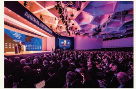
Congress Hall (main hall)