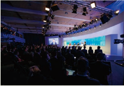
Panel discussion in a medium-sized venue