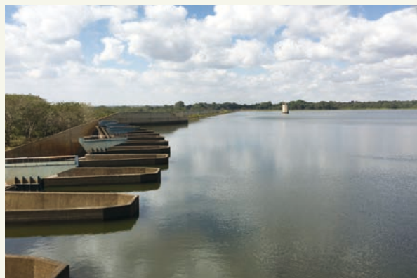
Figure 3 | The Kamuzu II Dam on the Outskirts of Lilongwe, Malawi, during the Drought in May 2016

who are found washing their car with clean tap water may face a stiffer penalty in some municipalities.