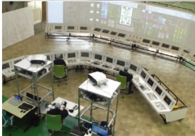
1 Facility for conducting comprehensive security training and verification against cyberattacks, and the use of a central control room mock-up for design evaluation