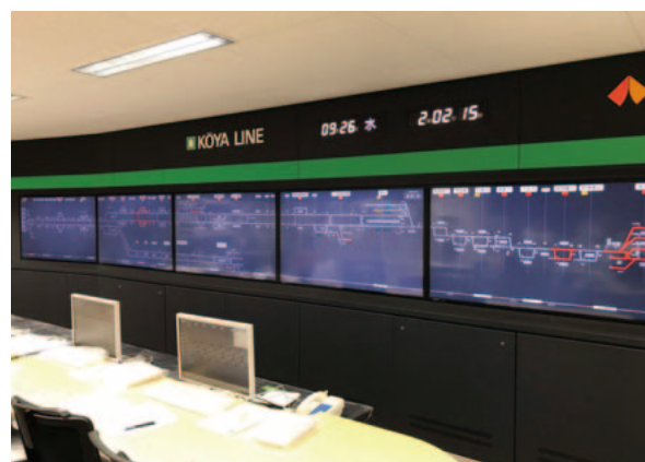
5 Traffic display panels and control consoles for Koya Line traffic management system currently under development

System development is currently proceeding with a target of operation commencing in March 2019.