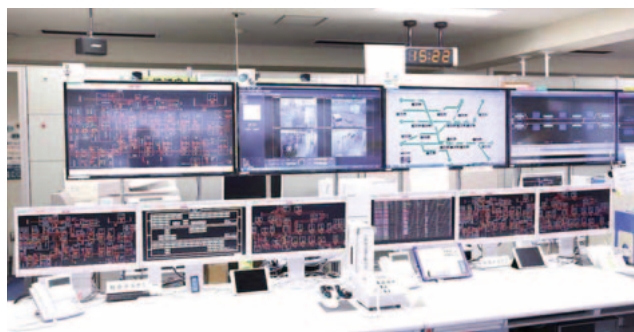
2 Central system control console for power management system at Tokyu Corporation

Additional functions were also provided for training drills and to assist control center staff, with the upgraded equipment commencing operation as required after the switchover to the new system in May 2016 and December 2017. The new system is contributing to improving the ability of control center staff to respond to incidents and faults and to faster recovery from incidents.