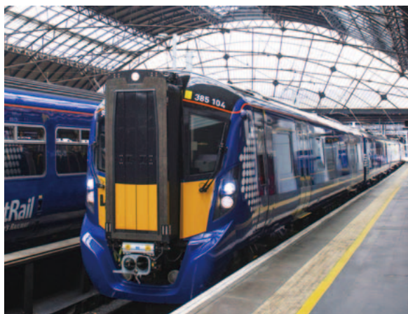
7 Class 385 train arriving at Glasgow Queen Street station

The Class 385 rolling stock represent the first order for Hitachi's AT-200. A total of 70 trains (234 cars) will be produced at Kasado Works in the Yamaguchi Prefecture of Japan and at a plant in Durham, UK. The maintenance contract is for a period of 10 years.