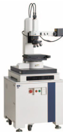
1 VS1800 Nano 3D Optical Interferometer

* The VS1800 is only available in Japan, China, and Taiwan.